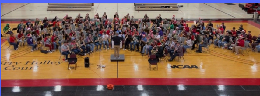
Northland Symphony Youth Saxophone Ensemble presented KC Saxophone Christmas 155 participated on December 15, 2024