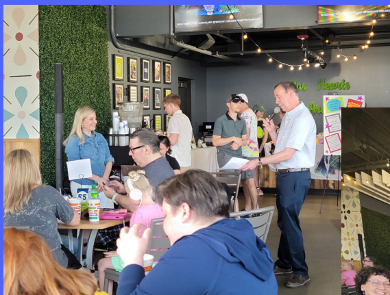
Trivia Night June 1, 2025