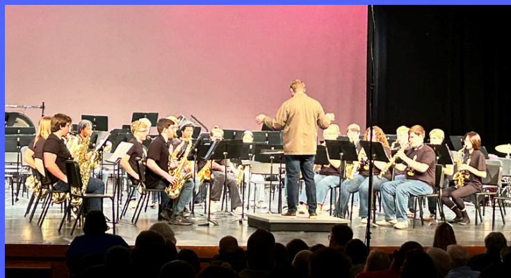
Northland Symphony Youth Saxophone Ensemble performing April 27, 2025