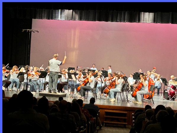
Northland Symphony Youth Orchestra performing April 27, 2025