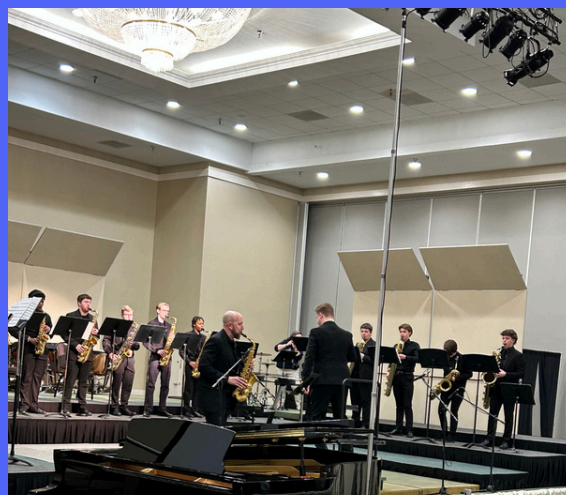
Northland Symphony Youth Saxophone Ensemble performing at the Missouri Music Educators Association Conference January 30, 2025