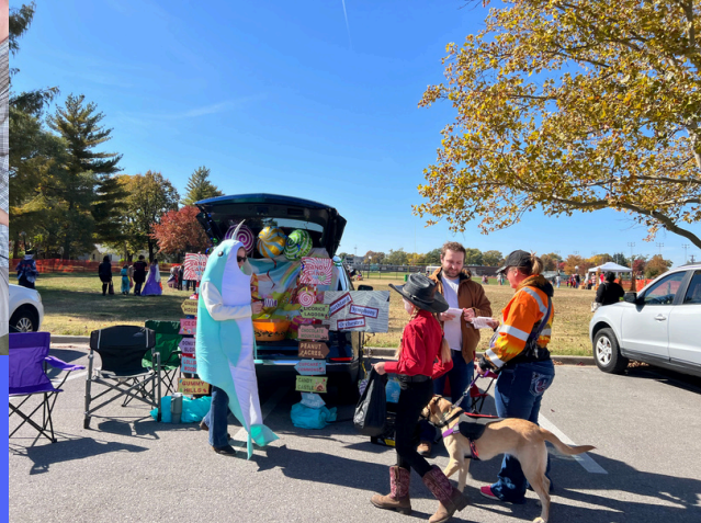
North Kansas City Trunk or Treat October 26, 2024