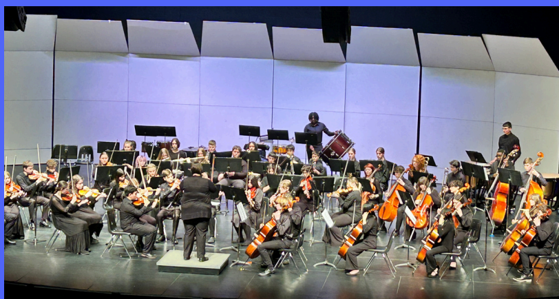
Northland Symphony Youth Sinfonia performing February 2, 2025