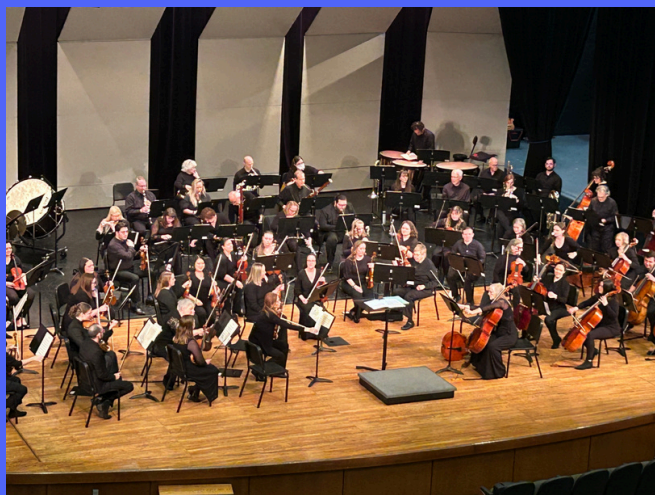
Northland Symphony Orchestra April 6, 2025